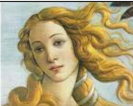
The Birth of Venus