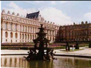
Palace of Versailles