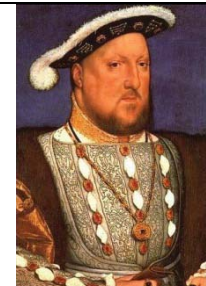
King Henry VIII