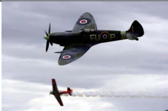
World War I