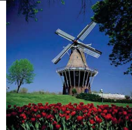
Holland – Dutch Traders