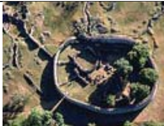
Ruins of Great Zimbabwe