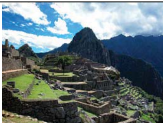
Ruins of Machu Picchu