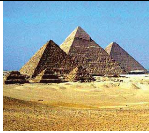
Pyramids at Giza