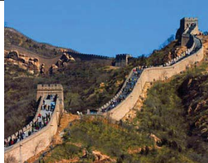
Great Wall of China