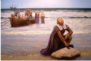
Pilgrim Fathers 1620