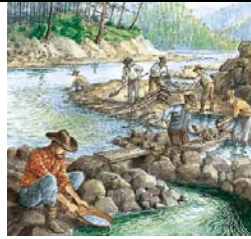
California Gold Rush