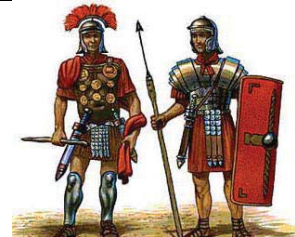
Ancient Roman Soldier